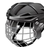
Helmets strongly recommended but not required