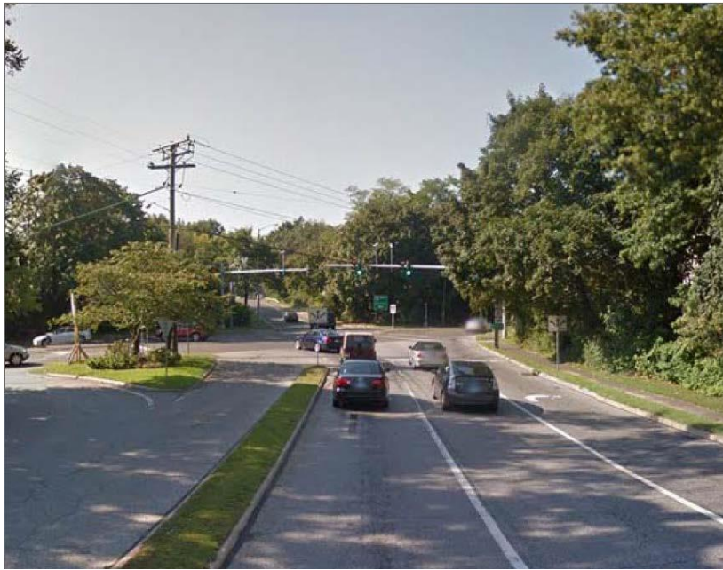
Image of Frontage Road to Delavan Avenue prior to project construction.