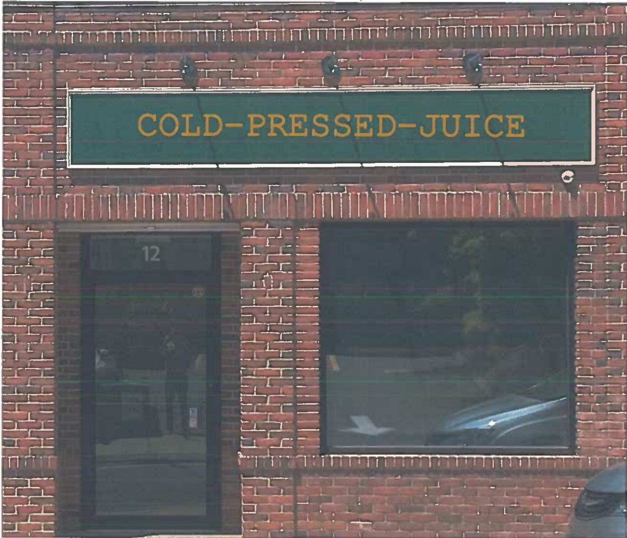
Sign 1 Rendering (Front facing) Riversville Rd